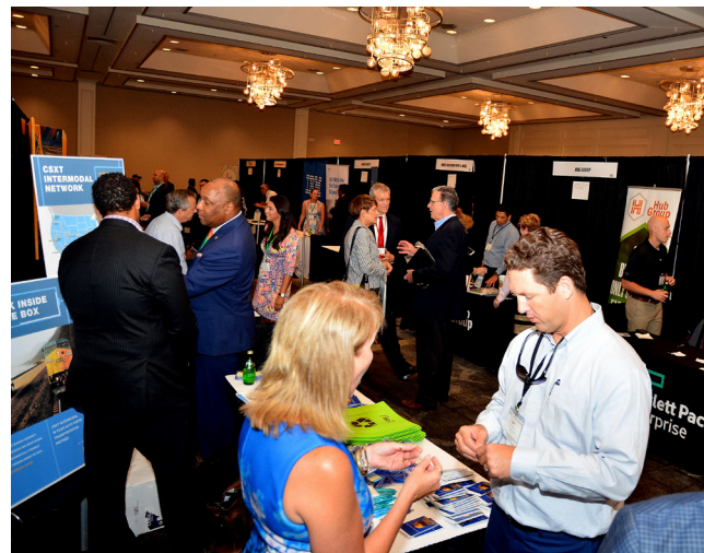
▲ Diverse companies and TOYOTA Tier 1 Suppliers networking